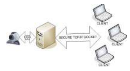
Figure 1. Application setting

In this context, the paper focuses on the development of an application for secure remote communication of video information between multiple clients of a network (figure 1), as the theme of a multidisciplinary project which can help students in understanding security and work with some equipments and programming languages. Web-cams are used as the main image acquisition equipment. These cheap devices can be acquired from any computer shop at low costs, more, they are also used in many security applications such as surveillance tasks. Still, almost no security objective is guaranteed for the commonly used off-the-shelf cameras, and securing them can be a challenging task.