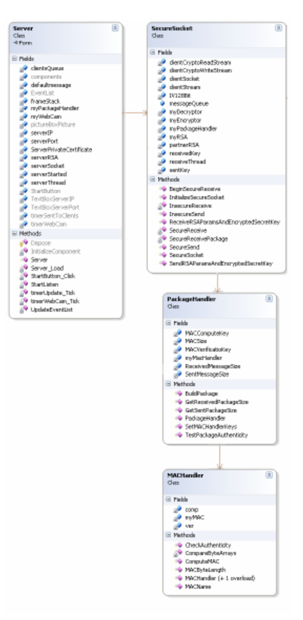
Figure 2. Application architecture

There are several ways in which one can acquire video information from a web-cam in Windows. Probably the most natural way is by using Windows Image Acquisition (WIA) see (http://support.microsoft.com/kb/266348) for more details. We used this library but there are also other alternatives, for example one can prefer to use the avicap32.dll library etc. Also, there is a nice example available at The Code Project based on WIA (http:// www.codeproject.com/KB/cs/WebCamService.aspx). In the application we used WIA and a timer triggered an event periodically to capture images from the web-cam.